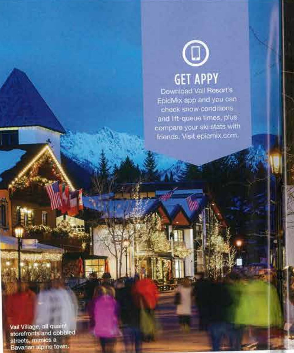
Vail Village, all quaint storefronts and cobbled streets, mimics a Bavarian alpine town.