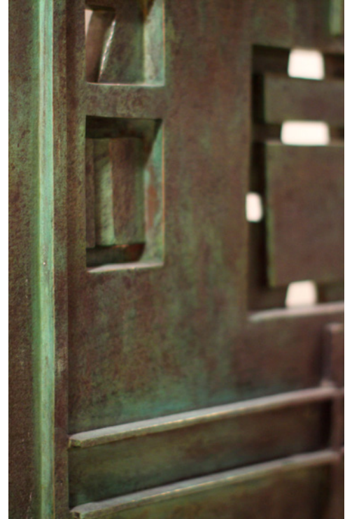
Gunther Gerzso, Totem, 110cm x 110cm x 8 cm, Bronze, 1995 This sculpture is located on the main level of The Sebastian.