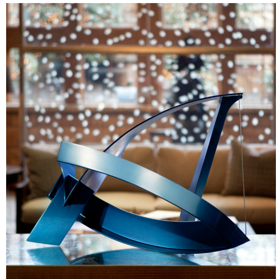
Manuel Felguérez, XVII 60 x 80x 56.5 cm, Painted Steel, 2010 This sculpture is located in the back lobby.