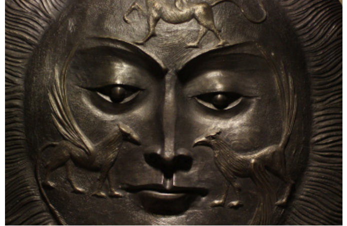
Leonora Carrington, Medallon con Pegasus Medallion with Pegasus, 190cm x 90cm x 9cm, Bronze, 2008 This sculpture is located in Bloom Spa.