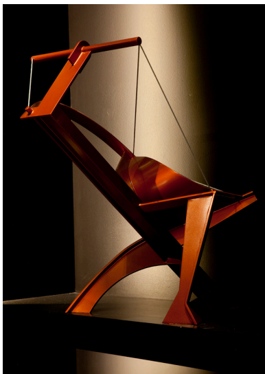
Manuel Felguérez, XIX 60 x 55x 48.5 cm, Painted Steel, 2010 This sculpture is located in The Library.