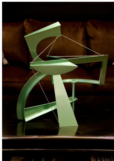
Manuel Felguérez, XVI 60 x 57.5x 44.3 cm, Painted Steel, 2010 This sculpture is located in The Library.