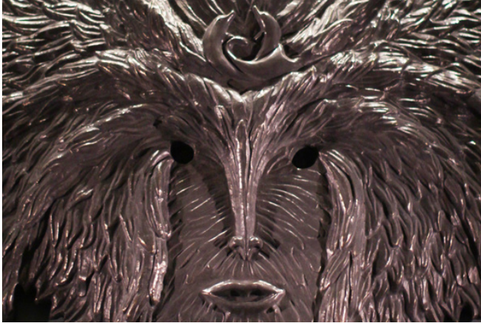
Leonora Carrington, Mascara de la Diosa, Mask of The Feathered Goddess, 140cm x 110cm x 18cm, Bronze, 2008 This sculpture is located in the lower level atrium.

Leonora Carrington was a world-renowned Mexican artist, surrealist painter, sculptor and novelist. Born in Britain, she eloped with Surrealist artist Max Ernst, ran in the same circles as Picasso and Dali, fled the Nazis, escaped from a Spanish psychiatric hospital and later settled in Mexico for more than six decades, where she built a reputation as one of the most original and visionary artists and writers of the 20th century. Carrington passed away in May, 2011.