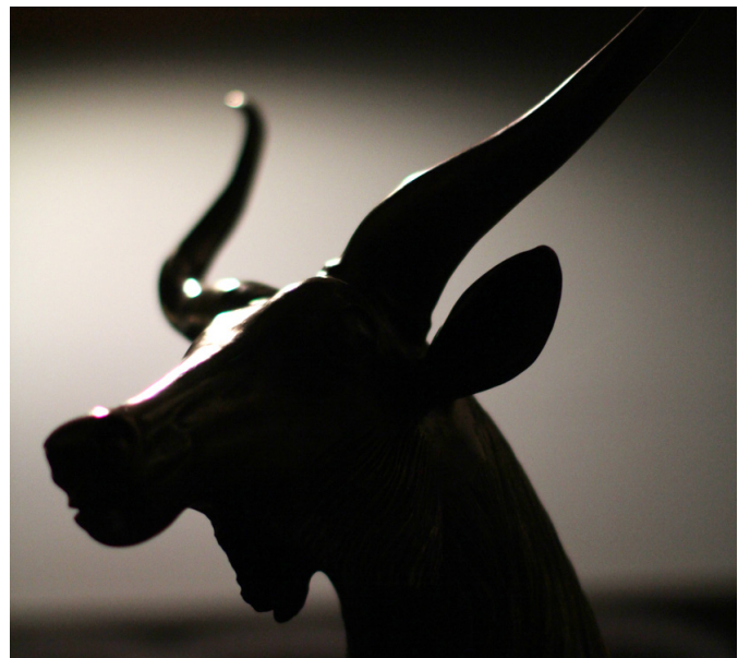
Leonora Carrington, La Hija del Minotauro, Minotauro's Daughter , 161 x 75 x 112cm, Bronze, 2008 This sculpture is located at the entrance to Leonora Restaurant.