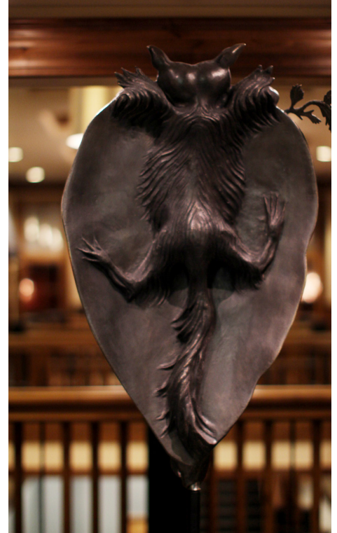
Leonora Carrington, Mascara Azul con Zorro , Blue Fox Mask , 170cm x 78cm x 60cm, Bronze , 2008 This sculpture is located in the upper level atrium of The Sebastian.