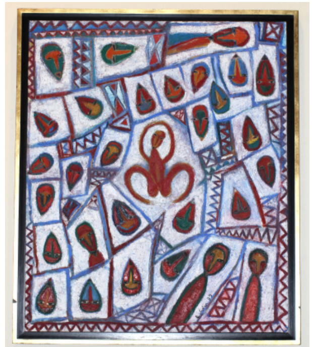
Victor Chaca, Acróbatas Acrobats, 120cm x 100cm, mixta y arena sobre tela This painting is located in Leonora Restaurant.