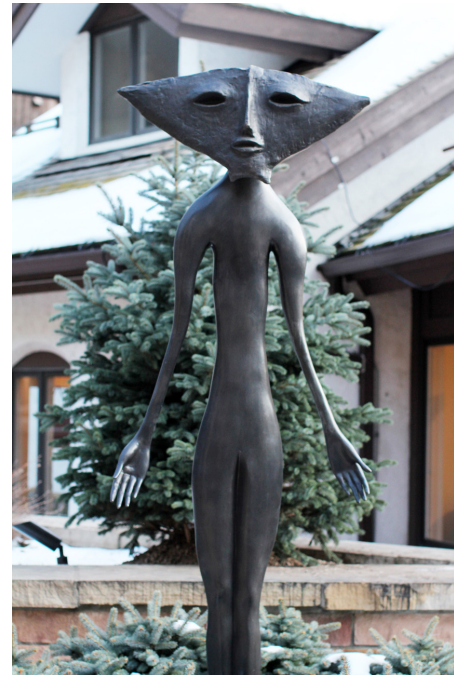
Leonora Carrington, Mariposa Mantarraya, Butterfly Stingray , 230cm x 88cm x 23cm, Bronze, 2008 This sculpture is located outdoors at the entrance to Leonora Restaurant.