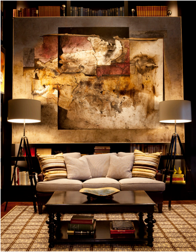
Manuel Felguérez, Ausencia Leve, Slight Absence , 2.40m x 3.20m, Oil on Canvas, 2008 This painting is located in The Library.

Manuel Felguérez was born on December 12, 1928 in the town of Valparaíso, Zacatecas. Over his lifetime Felguérez traveled between Mexico and Europe where he studied art in Paris at the Académie de la Grande Chaumière under the famous Russian sculptor Ossip Zadkine and later at the Académie Colarossi.