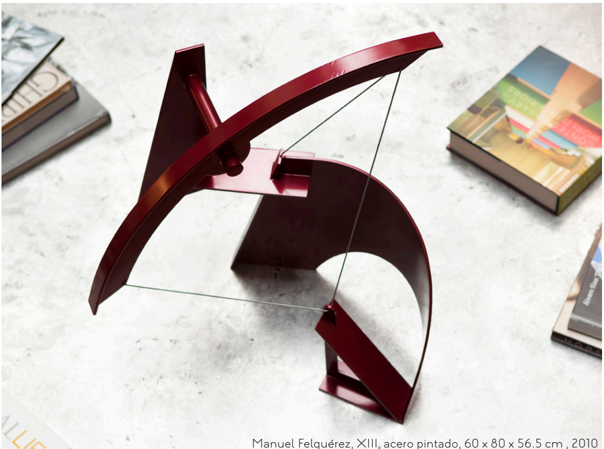
Manuel Felguérez, XIII, acero pintado, 60 x 80 x 56.5 cm , 2010

Paintings, Sculptures and Custom Details Featured at The Sebastian–Vail