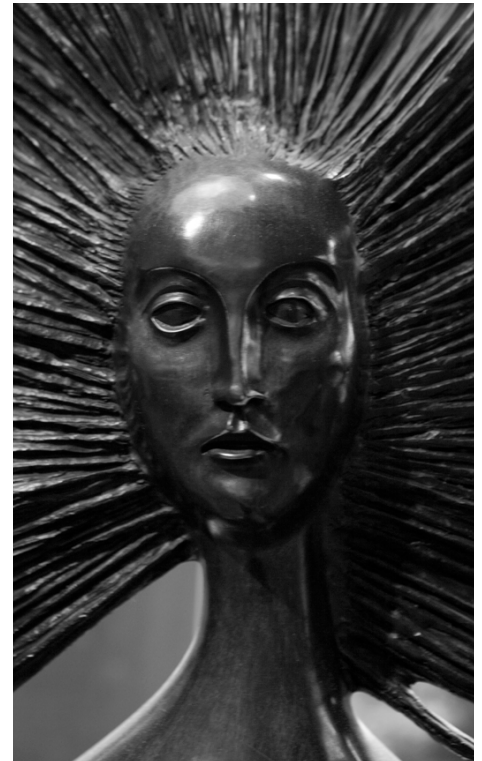
Leonora Carrington, Mujer con Zorro, Lady with Fox, 2.00m x 75cm x 80cm, Bronze, 2010 This sculpture is located in the back lobby of The Sebastian.