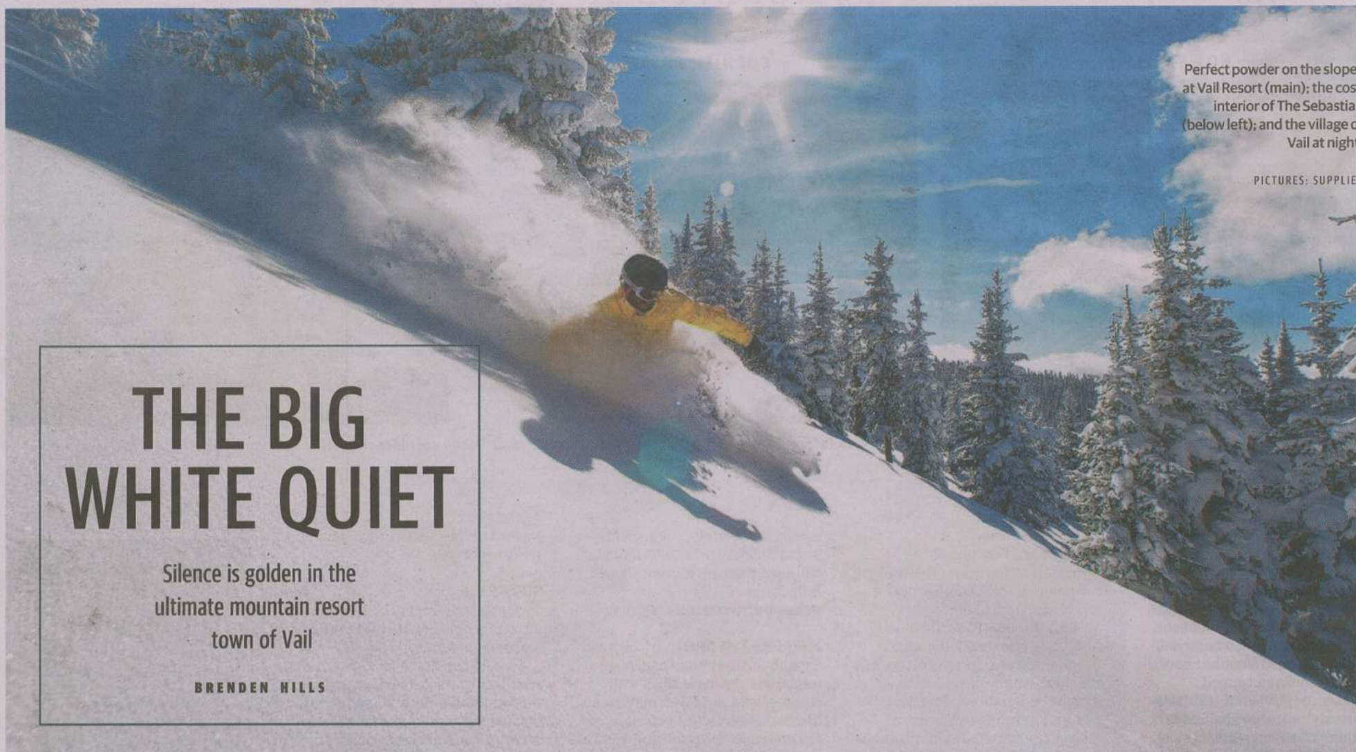
Perfect powder on the slope at Vail Resort (main); the cozy interior of The Sebastian (below left); and the village of Vail at night